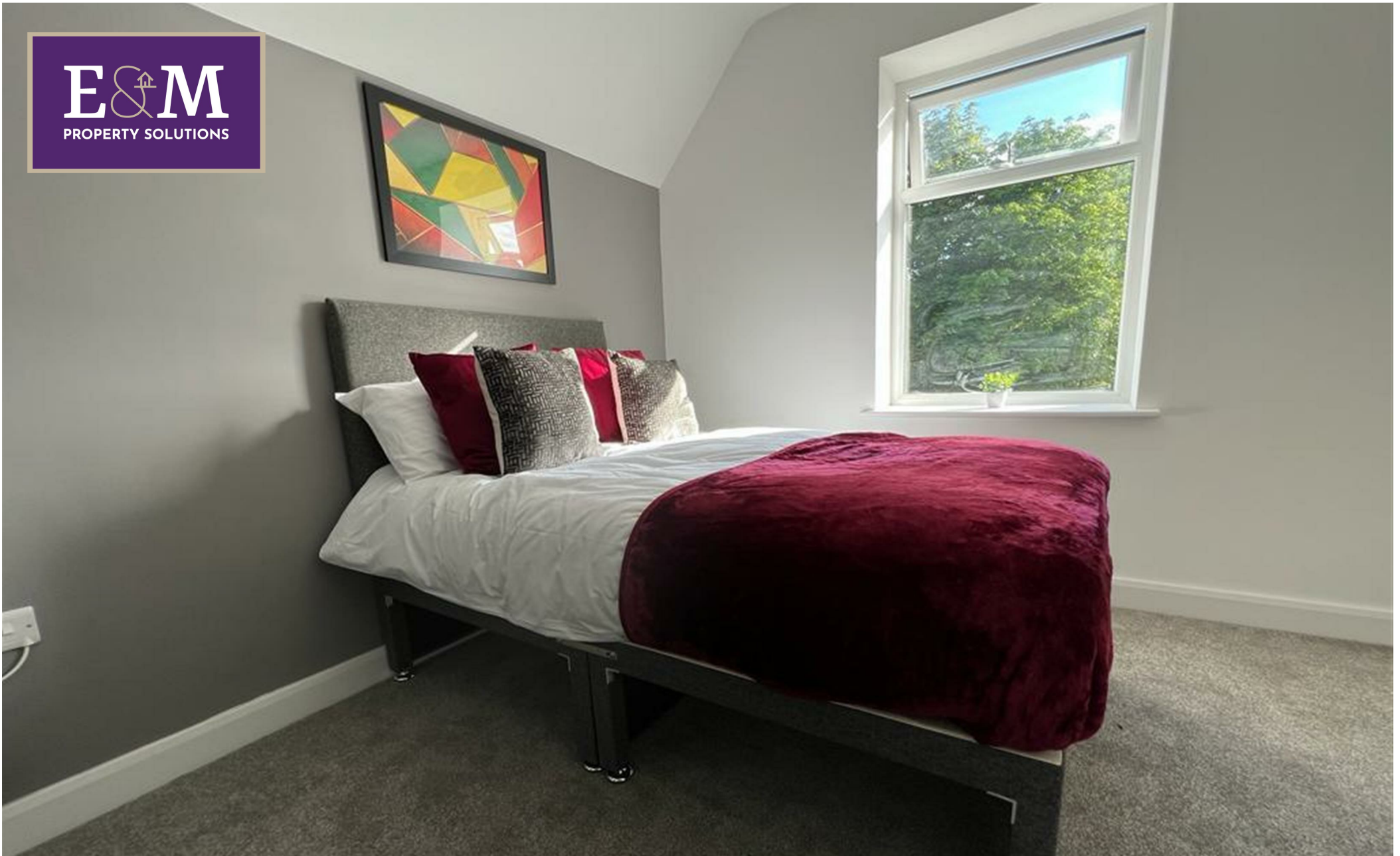
Room 9, 79-81 Church Street, Burnley, Lancashire, BB11 2RS £100 Per week